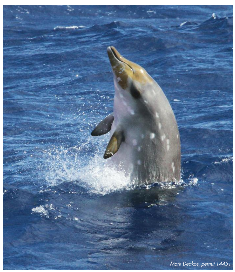
Blainville's beaked whale.

During 2016, the team will begin initial evaluation of the risk function fit and variations using available data. In 2017, additional data will be applied and statistical analyses conducted to evaluate the fit of the PMRF data to the AUTEC model. The final model will be completed in 2018 and submitted for peer-review.